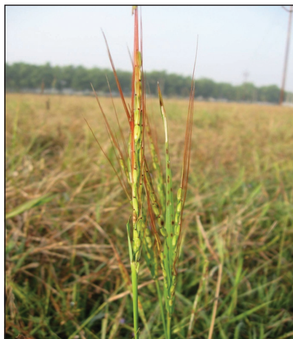
Plate-1(b) Oryza nivara