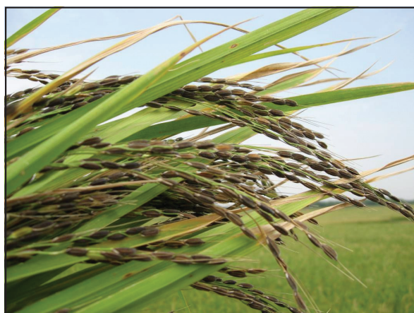
Plate-1(c) Oryza minuta