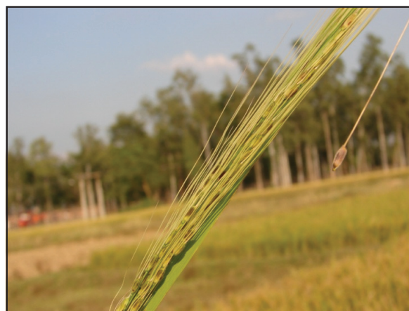
Plate-1(d) Oryza barthii

Plate-1(a-d): Four weedy rice species observed in lateritic belt of West Bengal and taken under this study.