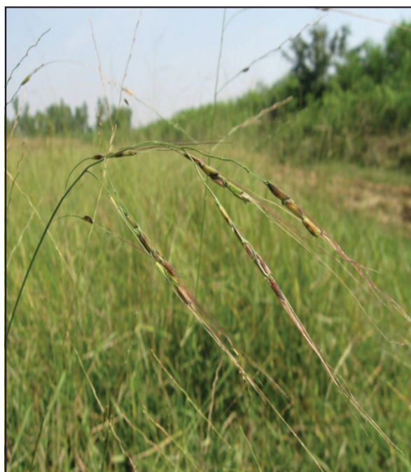
Plate-1(a) Oryza rufipogon