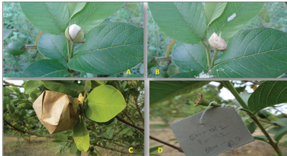
Fig. 2: A: Calyx breaking stage of flower; B: Emasculation of flower; C: bagged after emasculation of flower; D: Fruit set after crossing.