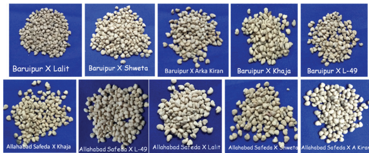
Fig. 4: Seeds of different crossing combinations

found that the winter season crop has the most fruit set and fruit retention.