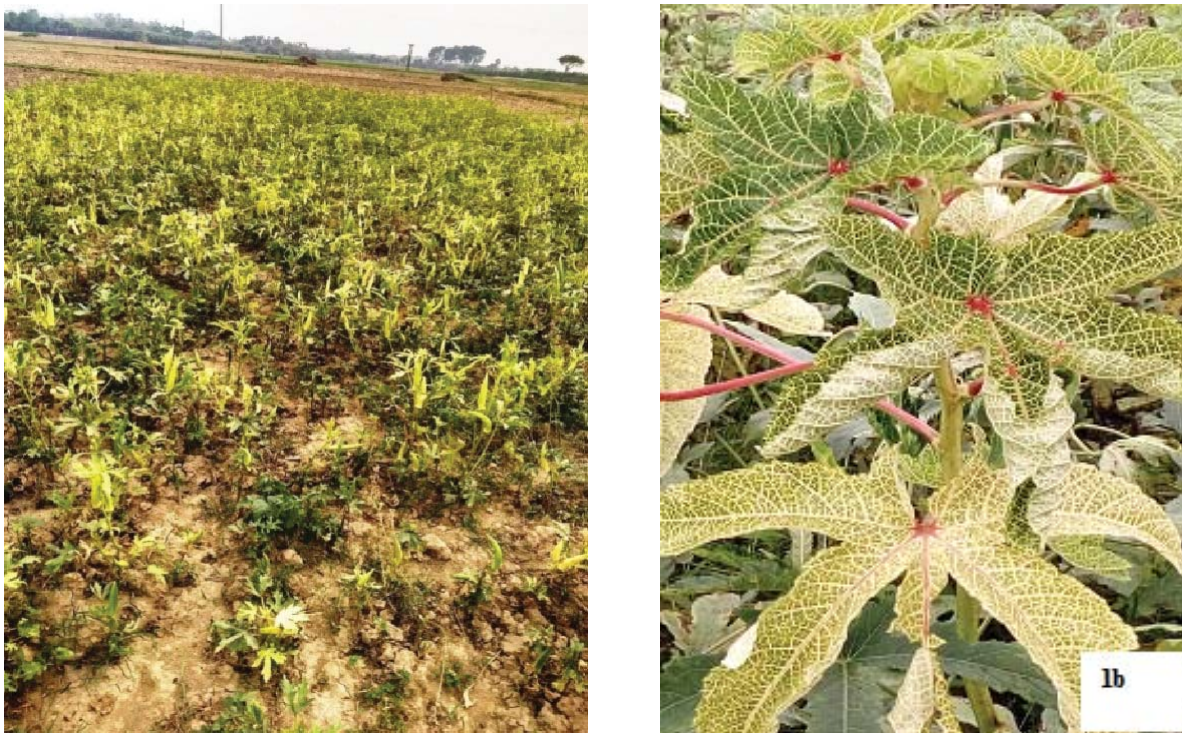
Fig.1: Yellow vein mosaic disease effected field in Krishnanagar, Nadia, West Bengal 1a. Okra field is showing 100% infection with severe yellowing of plants; 1b. Yellowing of veins with complete bleaching of interveinal tissues of leaves