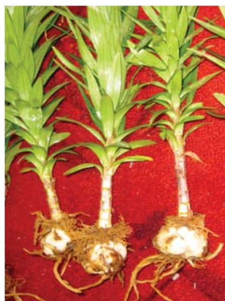
Plants Asiatic Lilium cv. Navona