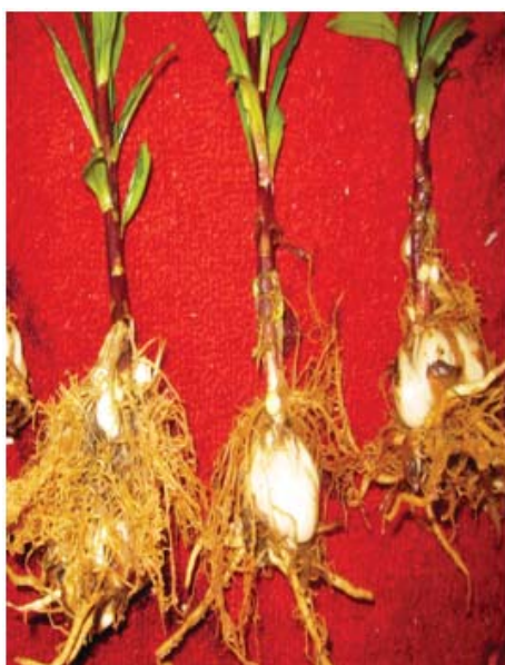
Plants of Asiatic Lilium cv. Serreda