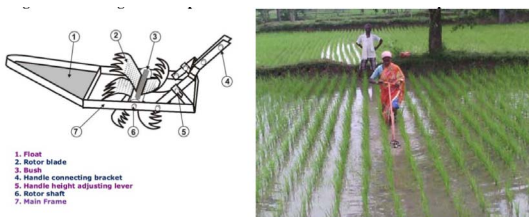
Fig. 3 : Ambika paddy weeder components and during operation in rice crop