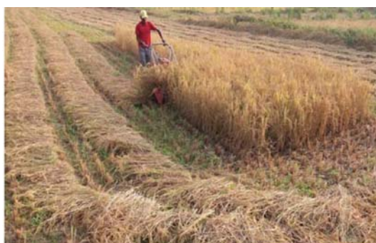
Fig. 4 : Self-propelled vertical conveyer reaper in operation