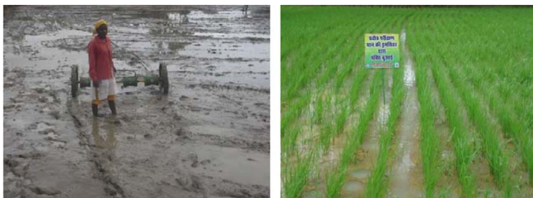
Fig. 2 : Line sowing of rice in puddled field with drum seeder and crop after 30 DAS