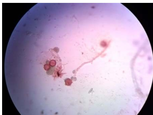
Fig.2: Germination and pollentube formation