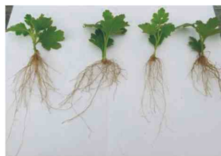
Fig 3: Variation in number of roots as influenced by irradiation A) 15 DAP B) 25 DAP and C) 35 DAP